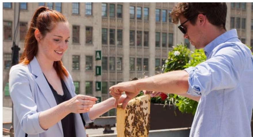
2. MEET YOUR BEES