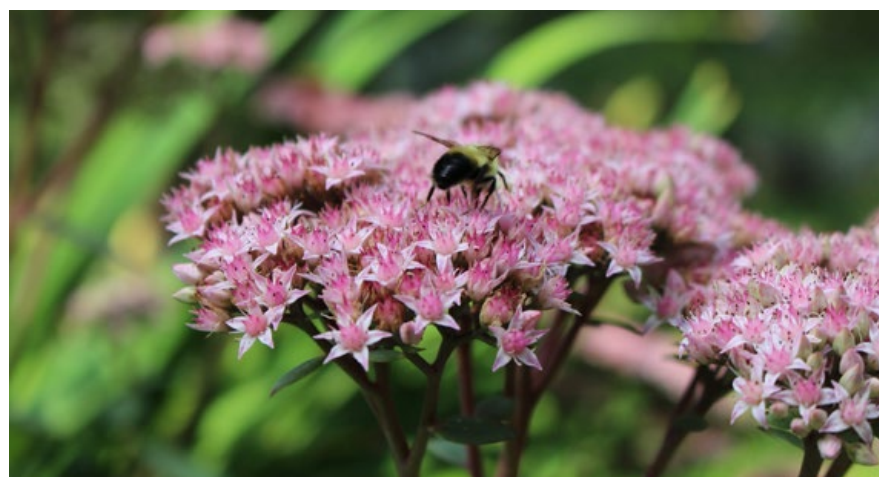
4. POWERFUL POLLINATORS