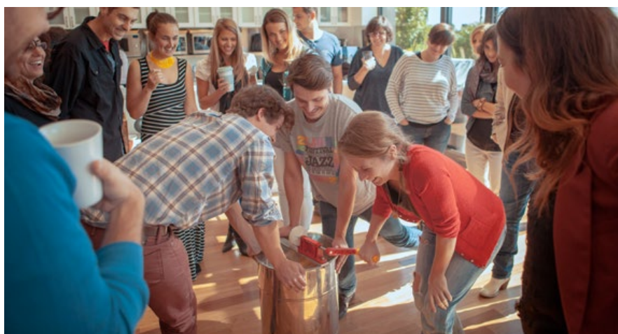
3. FROM HIVE TO HONEY JAR