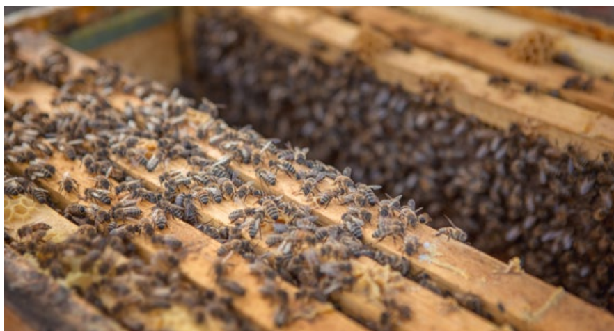
1. DISCOVER THE WORLD OF BEES

Our workshops set the table for deeper, more meaningful interactions with bees. They are hour-long immersive conferences or interactive activities that aim to create a bridge between your team and the beekeeping project.